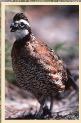
Small Game Project