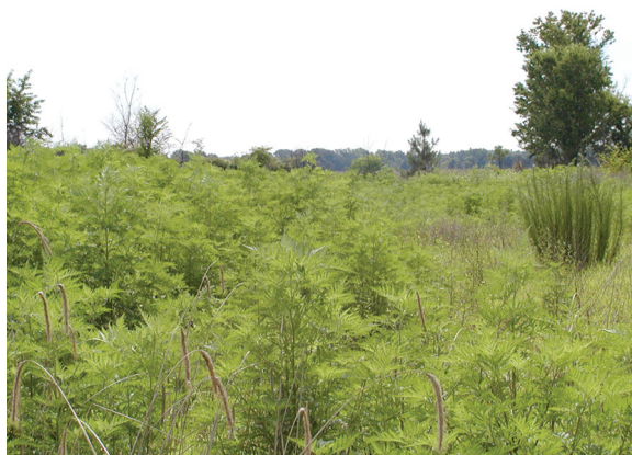
Ragweed plant structure provides sparse vegetation at ground level that allows for easier mobility. The thick cover at the top of the plant supplies shade and protection from avian predators.