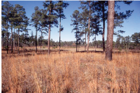
The low basal area in this stand allows for an abundance of sunlight that stimulates the growth of beneficial nesting vegetation.